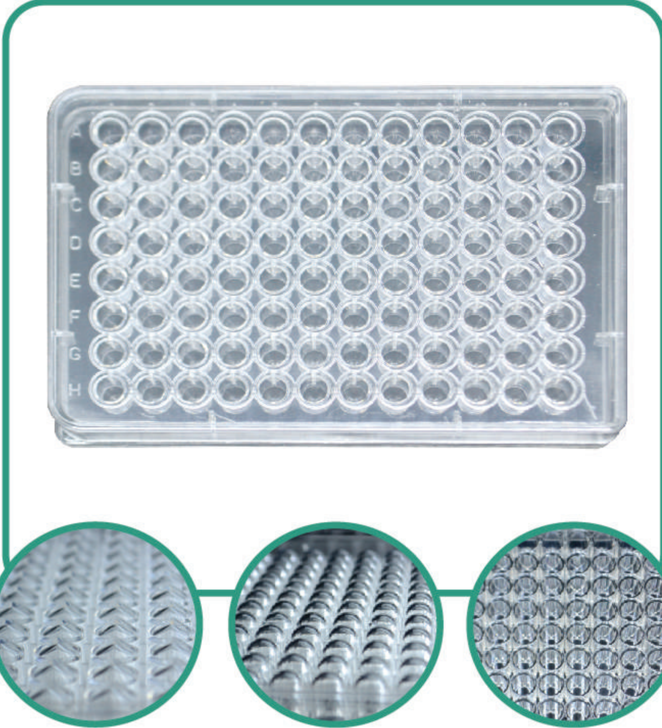
V Bottom U Bottom Flat Bottom