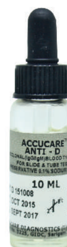
Anti D(Rh) Sera (1x10ml)