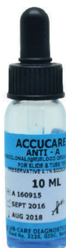
Anti A Sera (1x10ml)