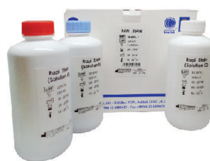
Rapi Stain 3x500ml