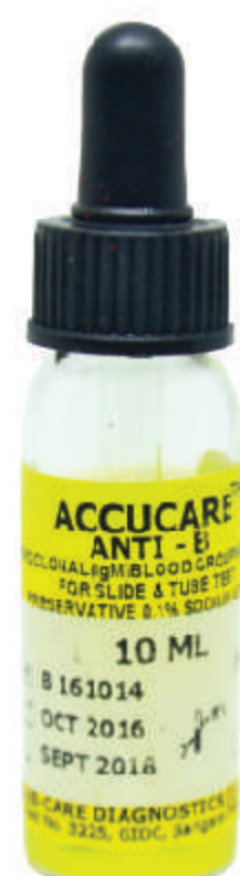
Anti B Sera (1x10ml)