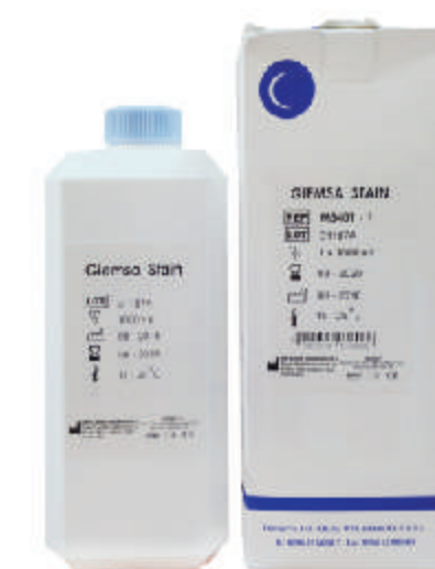
Giemsa Stain 1x1000ml