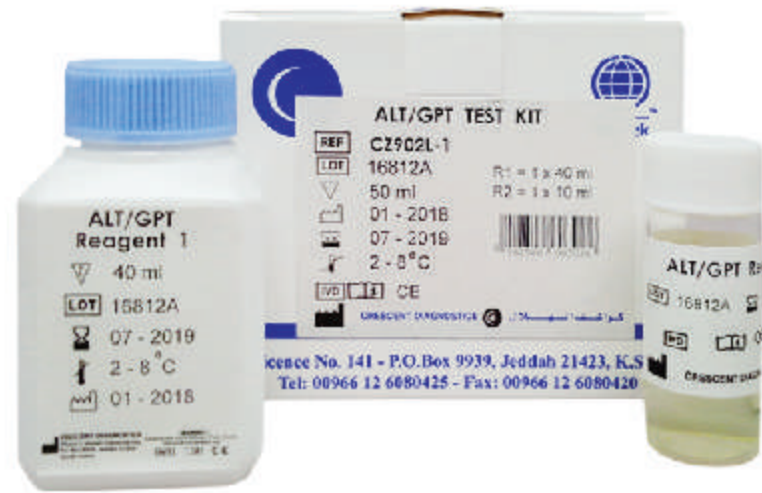
SGPT Kinetic 1x50ml