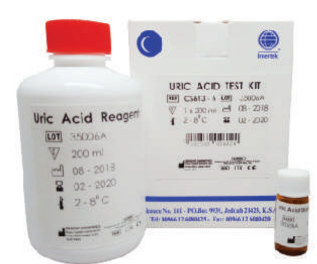
Uric Acid 1x200ml