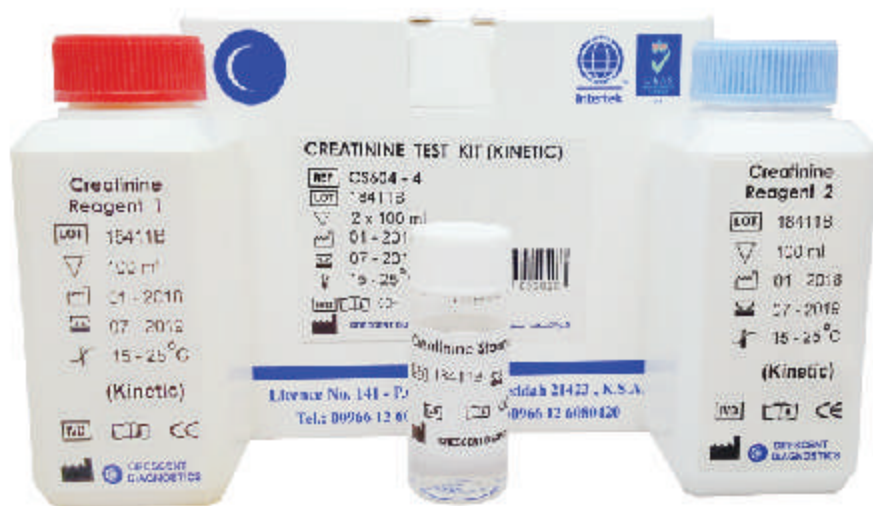
Creatinine (Kinetic) 2x100ml