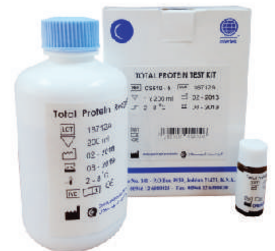
Total Protein Test Kit 1x200ml