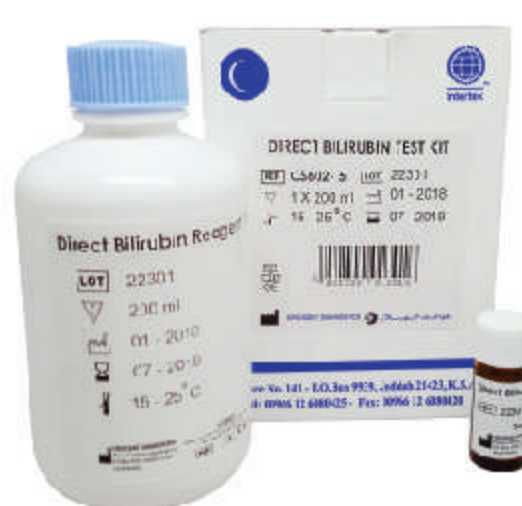
Direct Bilirubin Test Kit 1x200ml