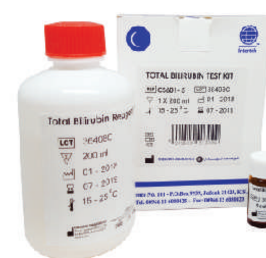
Total Bilirubin Test Kit 1x200ml