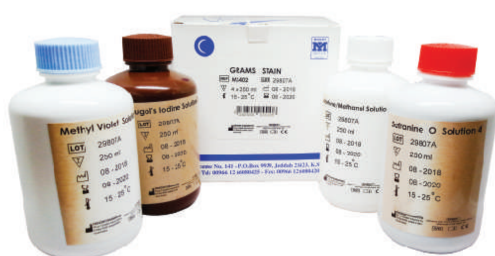
Gram Stain 4x250ml