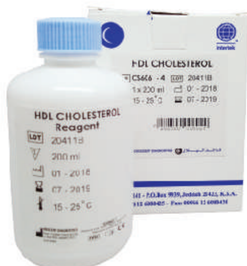
HDL Cholesterol 1x200ml